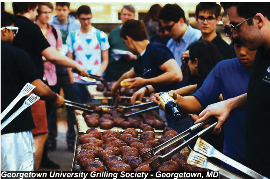
Georgetown University Grilling Society - Georgetown, MD

The ease of use combined with the opportunity to serve 300+ burgers every Friday are some things we love about Big John. The smell of charcoal burning and beef cooking matched with the sounds of laughter and classic rock are what make Every Friday so special for us here at Georgetown. We would not be able to continue this 16 year tradition of serving delicious burgers every week if it were not for Big John Grills. We love our Big John grills. We look forward to ordering many more grills in the future. - Georgetown Univ. Grilling Society