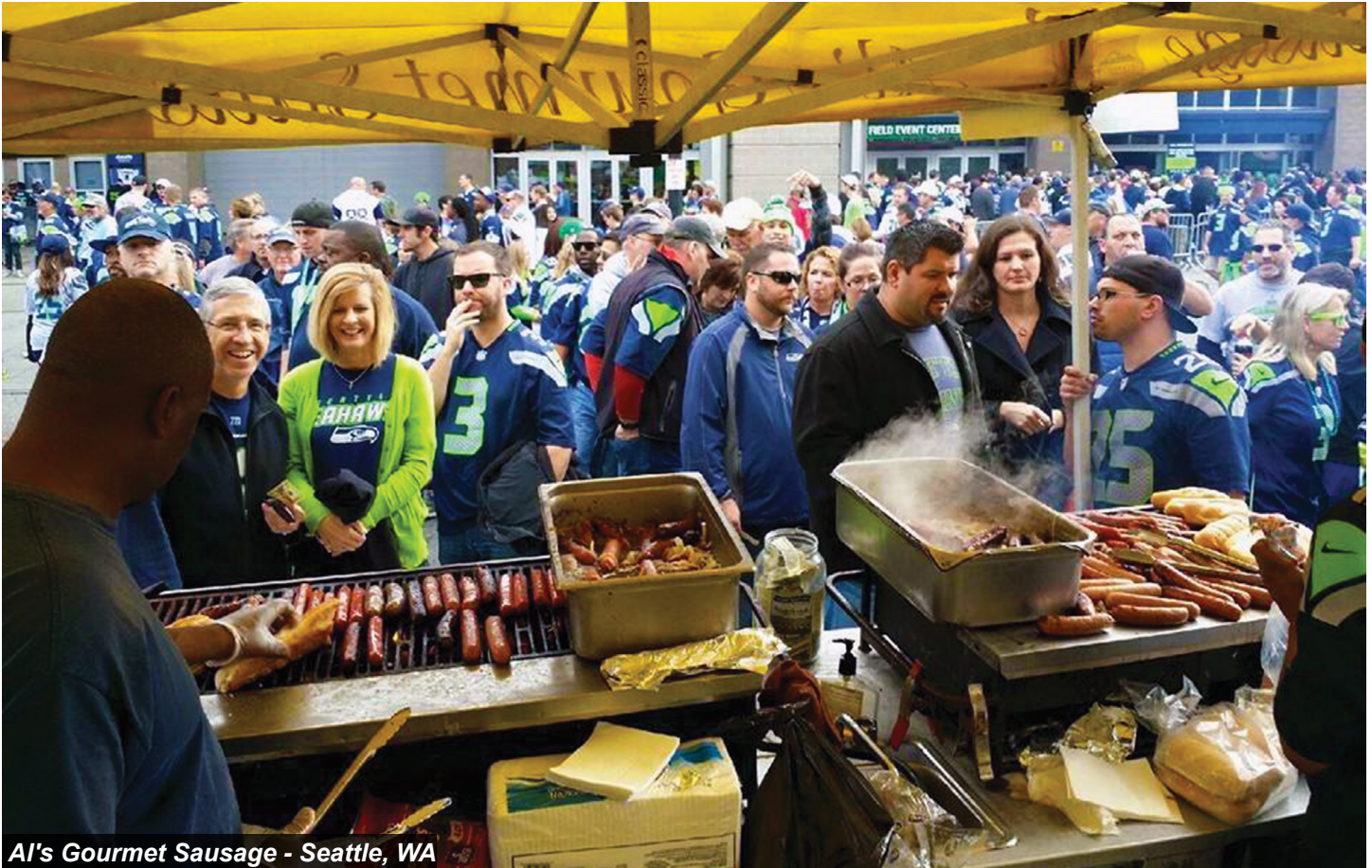
Al's Gourmet Sausage - Seattle, WA