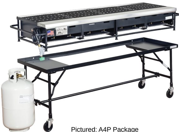
Pictured: A4P Package

PACKAGES include Cast Iron Cooking Grates, 30 lb. Propane Tank, Folding Leg Cart, & Leg Brace