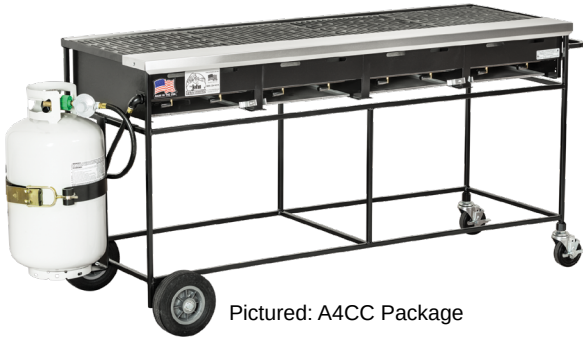
Pictured: A4CC Package

PACKAGES include Cast Iron Cooking Grates, 30 lb. Propane Tank, & Propane Tank Holder.