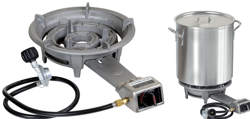
Pictured: KK50 and KK50 with 40 Qt. Pot