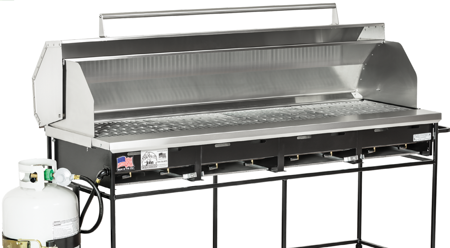
Pictured: A4CC Package with Hood