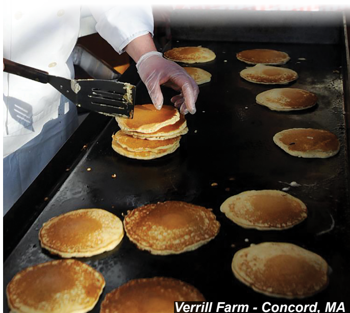
Verrill Farm - Concord, MA

6 Individual Burners // 180,000 BTU Output Cooking Surface 72" W x 20" D // Overall 80" W x 23" D x 36" H // 245 lbs.