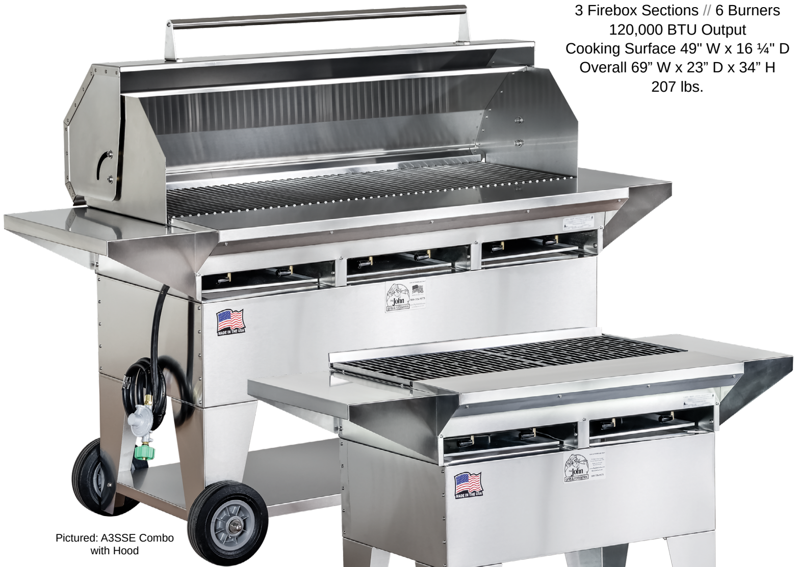
Pictured: A3SSE Combo with Hood

3 Firebox Sections // 6 Burners 120,000 BTU Output Cooking Surface 49" W x 16 ¼" D Overall 69" W x 23" D x 34" H 207 lbs.