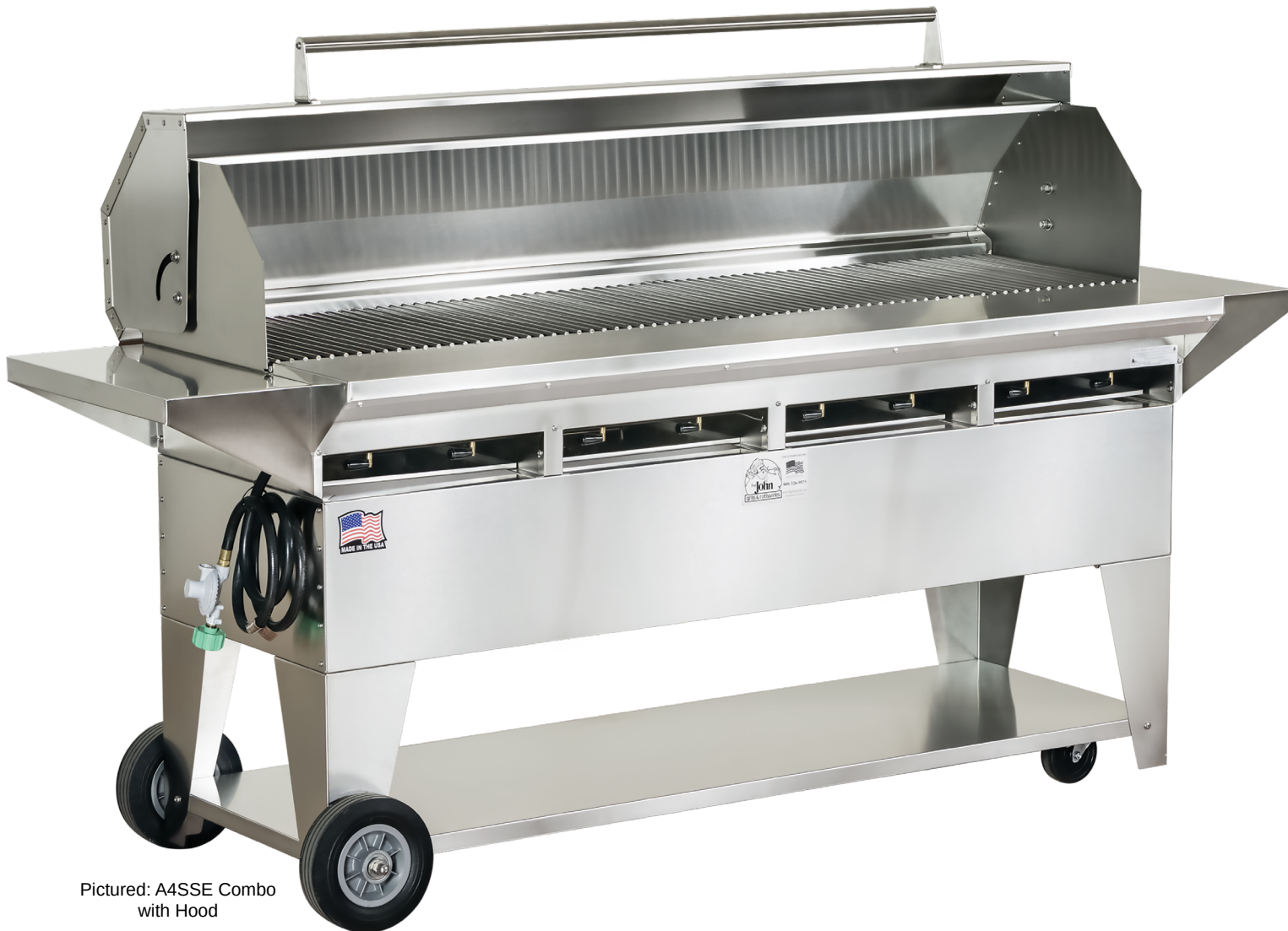
Pictured: A4SSE Combo with Hood