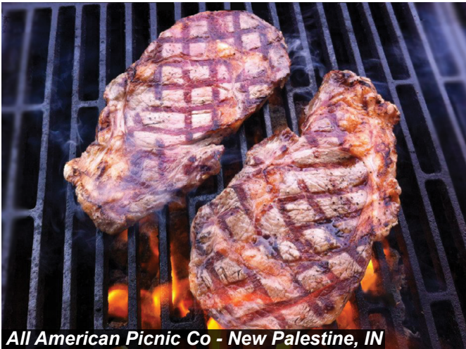
All American Picnic Co - New Palestine, IN