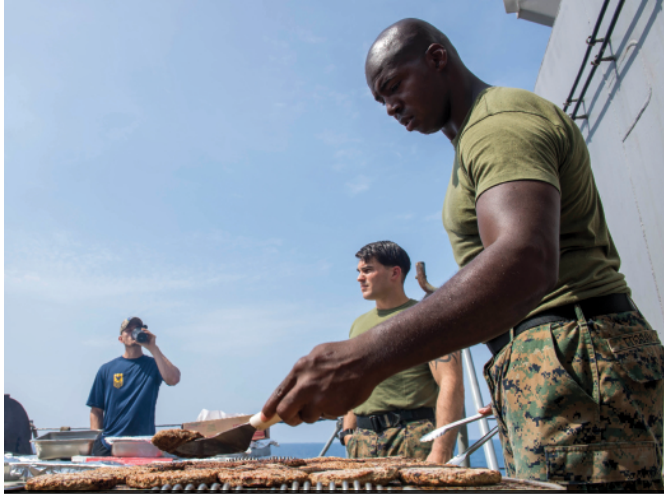
USS Oak Hill - Mediterranean Sea

When you build grills that can last for 30+ years, you end up with a lot of happy customers. For 57 years our quality and durability remain unmatched and our customer service is like no other. We hear daily from loyal customers who have 20+ year-old grills and just need a replacement part. If you have a Big John story we'd love to hear from you! You may even find yourself in next years' catalog or featured on our Facebook page.