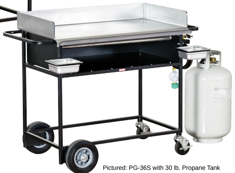
Pictured: PG-36S with 30 lb. Propane Tank

3 Individual Burners // 90,000 BTU Output Cooking Surface 36" W x 20" D Cooking Surface 44" W x 23" D x 36" H // 155 lbs.