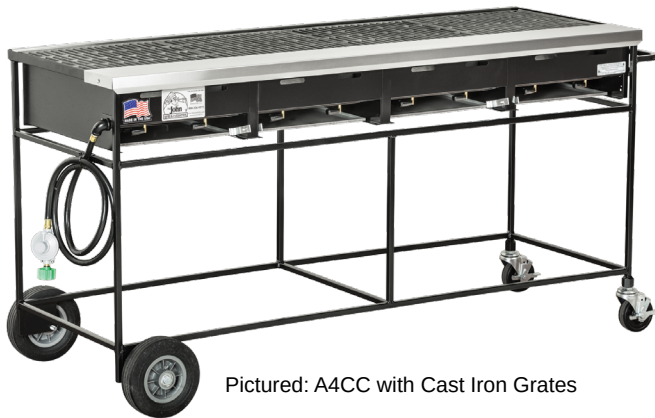
Pictured: A4CC with Cast Iron Grates