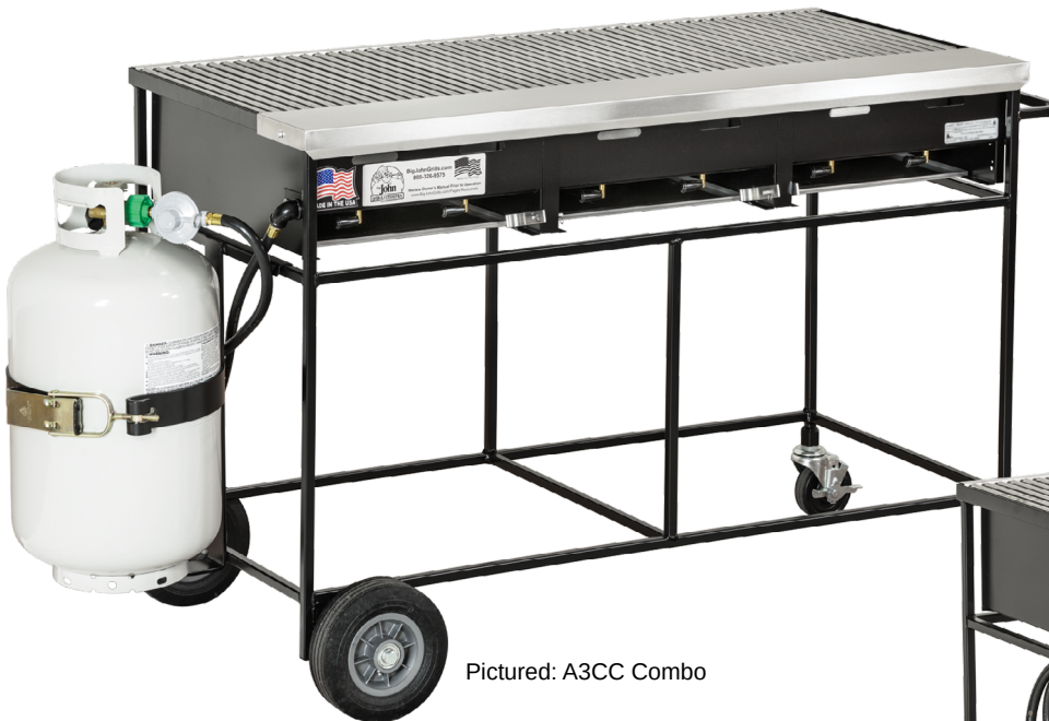
Pictured: A3CC Combo