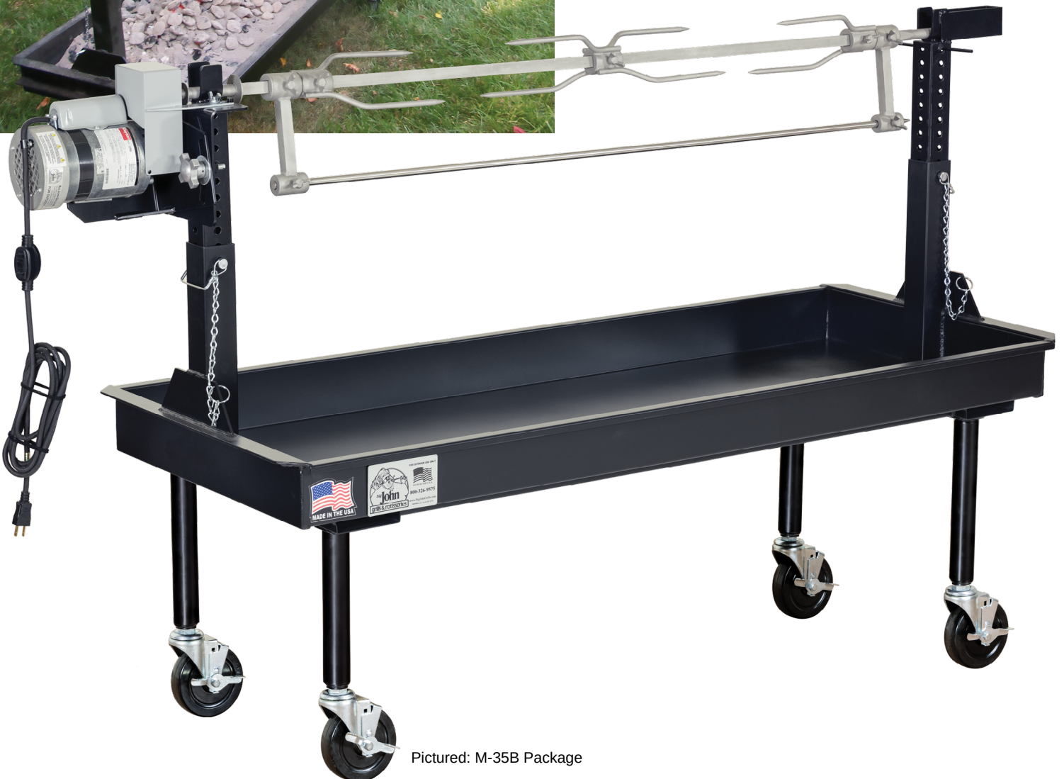
Pictured: M-35B Package

Rotisserie Only // Overall 78" W x 24" D x 37-48" H (Rotisserie Adjusts from 13" to 24" H) 125 lb. Spit Capacity // 5' Spit Length Screw-In Legs // 5" Casters // 170 lbs.