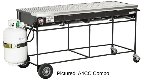
Pictured: A4CC Combo

PACKAGES include Cast Iron Cooking Grates, 30 lb. Propane Tank, & Propane Tank Holder.