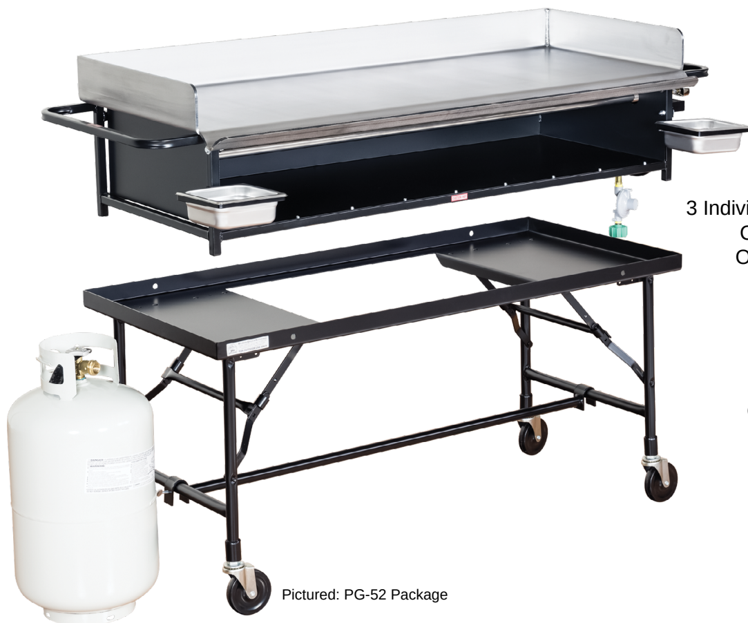
Pictured: PG-52 Package