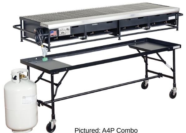
Pictured: A4P Combo

PACKAGES include Cast Iron Cooking Grates, 30 lb. Propane Tank, Folding Leg Cart, & Leg Brace