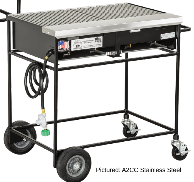
Pictured: A2CC Stainless Steel

2 Firebox Sections // 4 Burners 80,000 BTU Output Cooking Surface 32 ½" W x 16 ¼" D Overall 40" W x 23" D x 34" H 137 lbs.