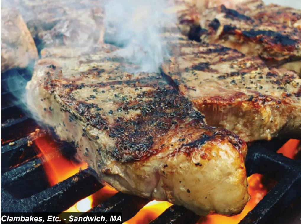
Clambakes, Etc. - Sandwich, MA