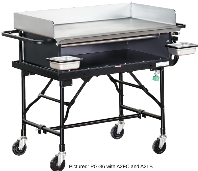
Pictured: PG-36 with A2FC and A2LB