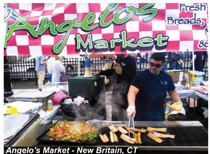
Angelo's Market - New Britain, CT