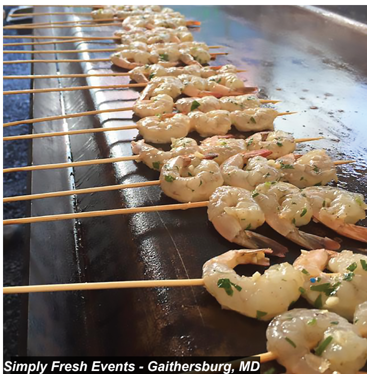
Simply Fresh Events - Gaithersburg, MD