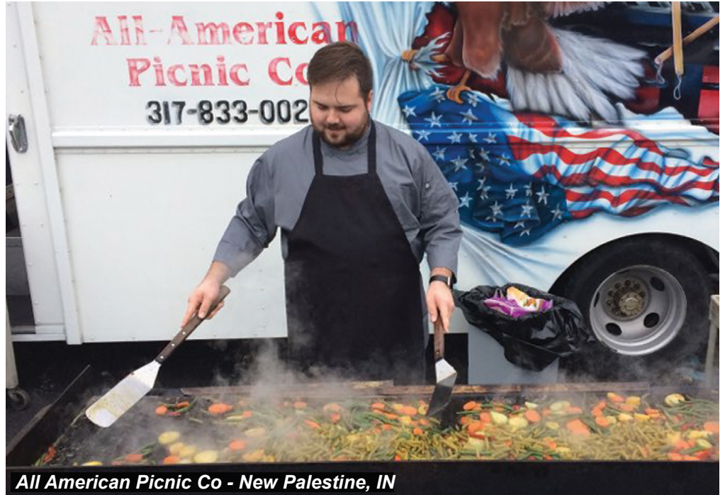
All American Picnic Co - New Palestine, IN