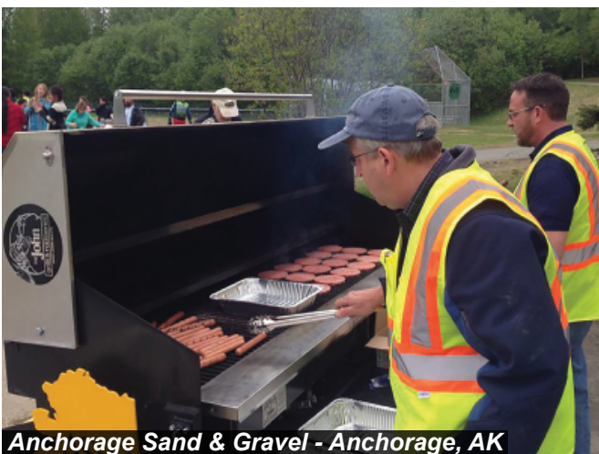
Anchorage Sand & Gravel - Anchorage, AK