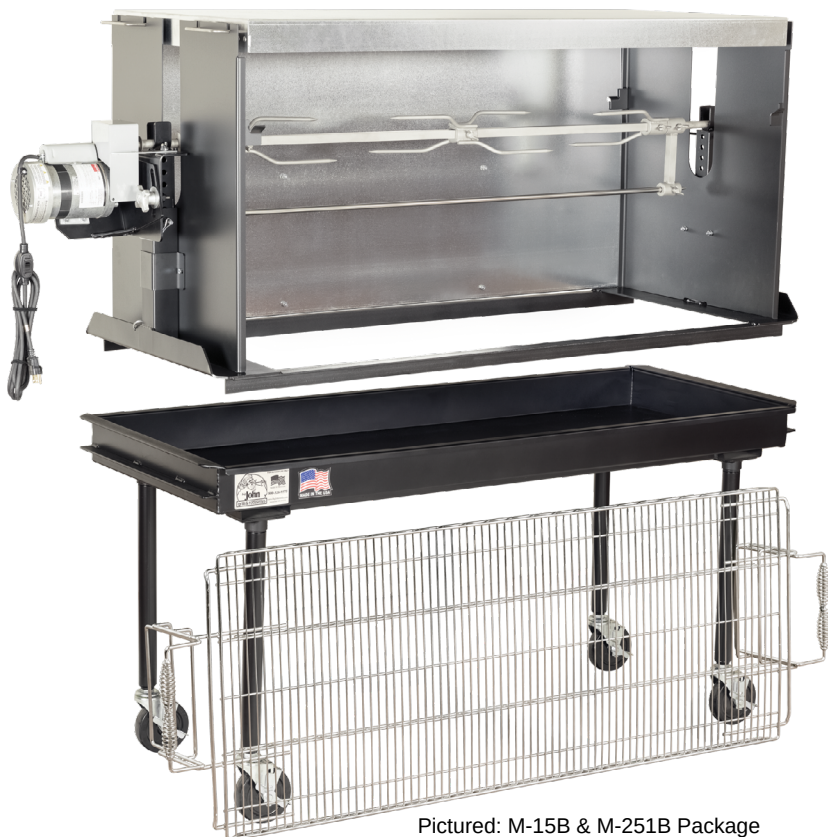
Pictured: M-15B & M-251B Package

Add-on Rotisserie for M-15B // Overall 78" W x 24" D x 13-24" H (Rotisserie Adjusts from 13" to 24" H) 125 lb. Spit Capacity // 5' Spit Length // 112 lbs.