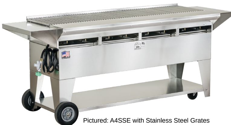
Pictured: A4SSE with Stainless Steel Grates