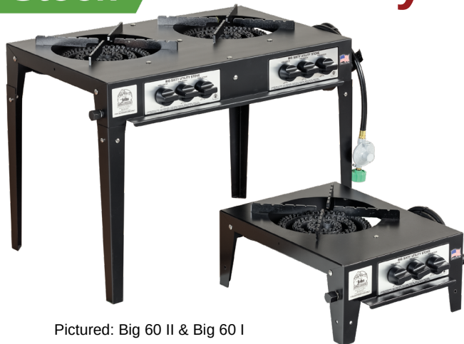
Pictured: Big 60 II & Big 60 I