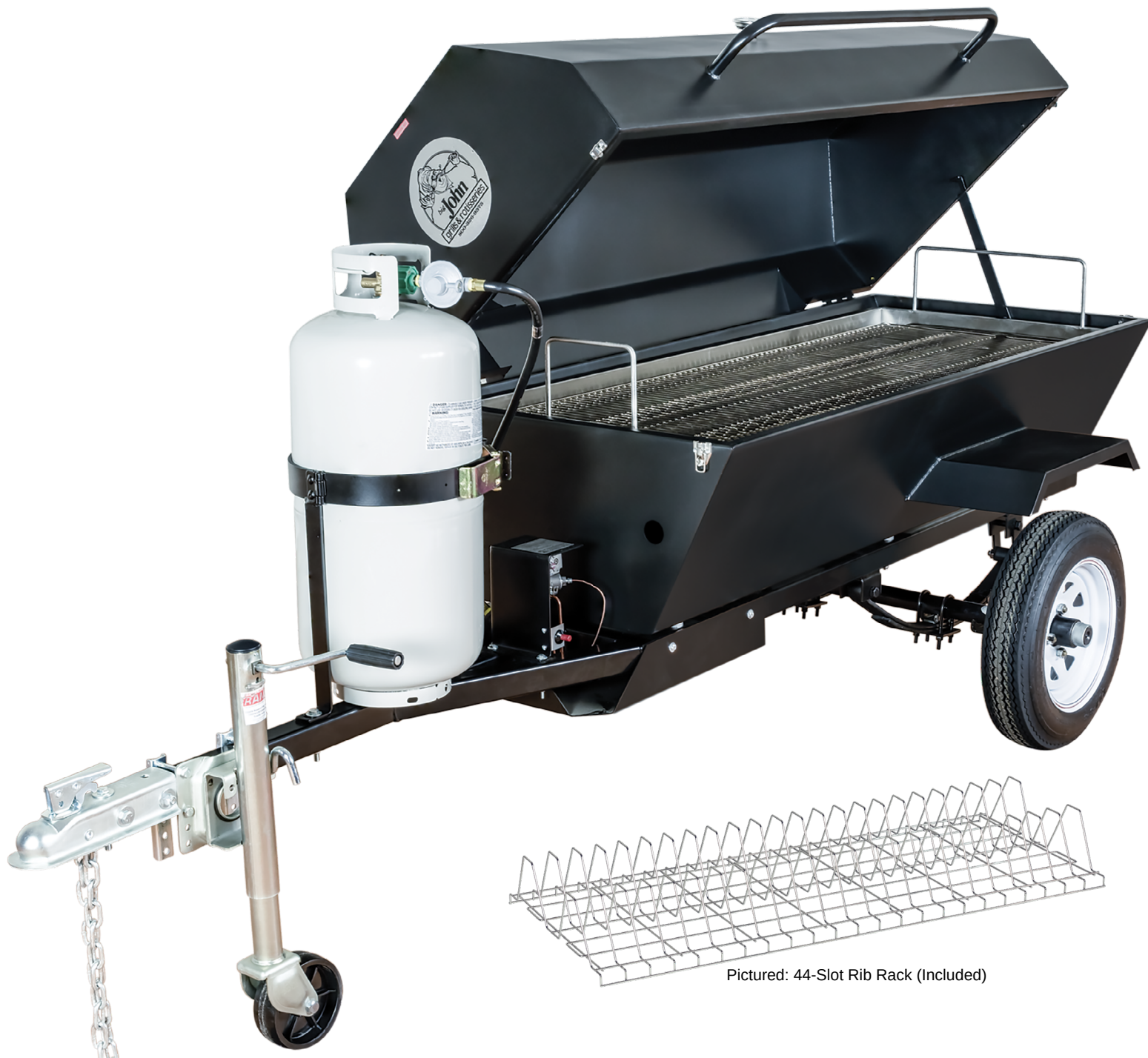
Pictured: E-Z Way Smoker/Roaster