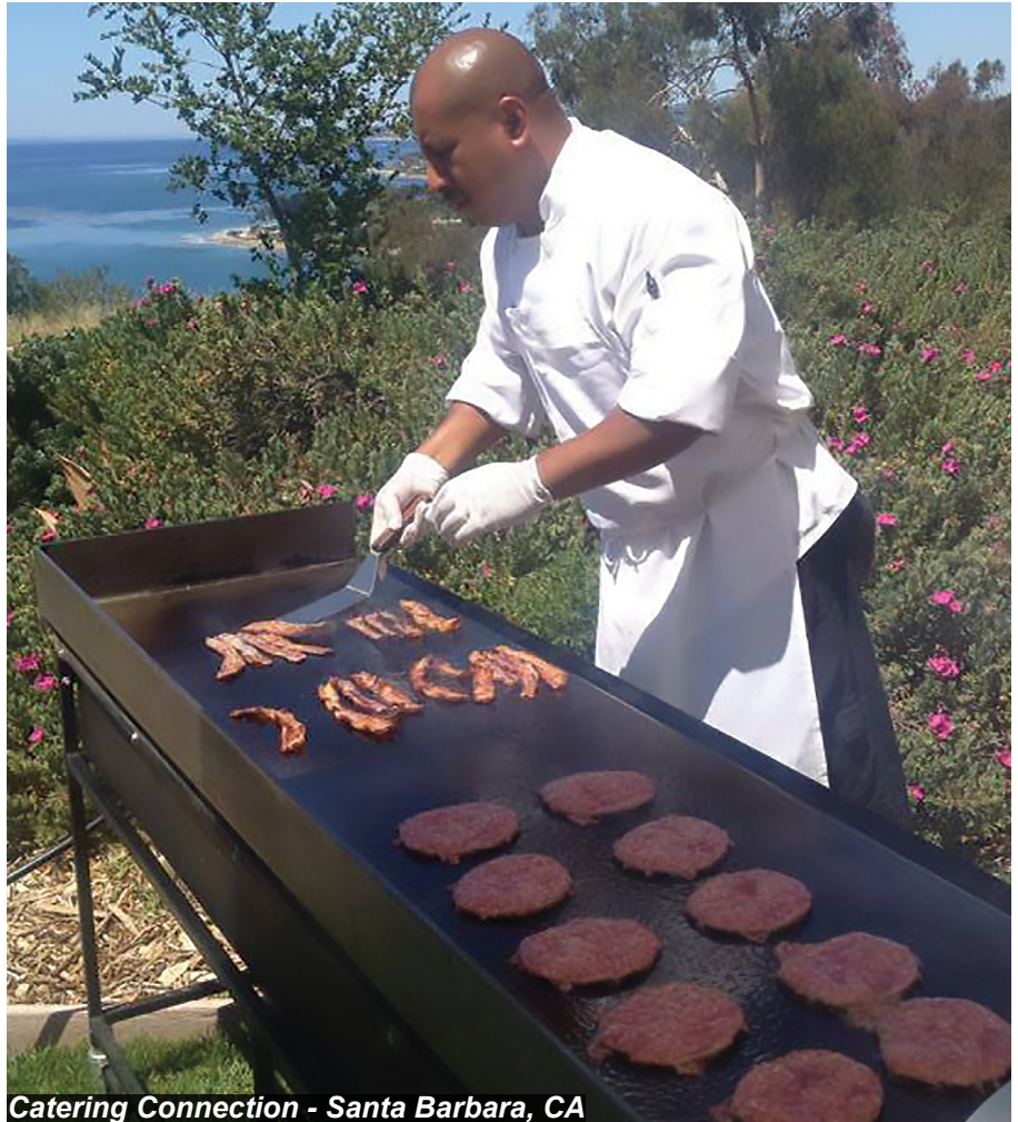
Catering Connection - Santa Barbara, CA