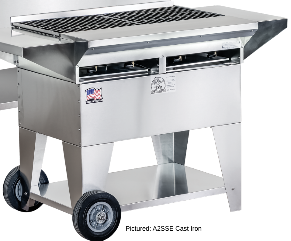
Pictured: A2SSE Cast Iron

2 Firebox Sections // 4 Burners 80,000 BTU Output Cooking Surface 32 ½" W x 16 ¼" D Overall 53" W x 23" D x 34" H 147 lbs.