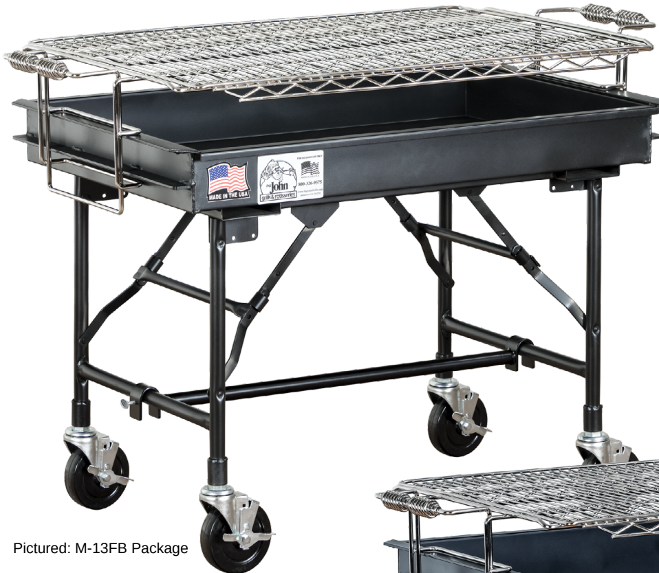
Pictured: M-13FB Package