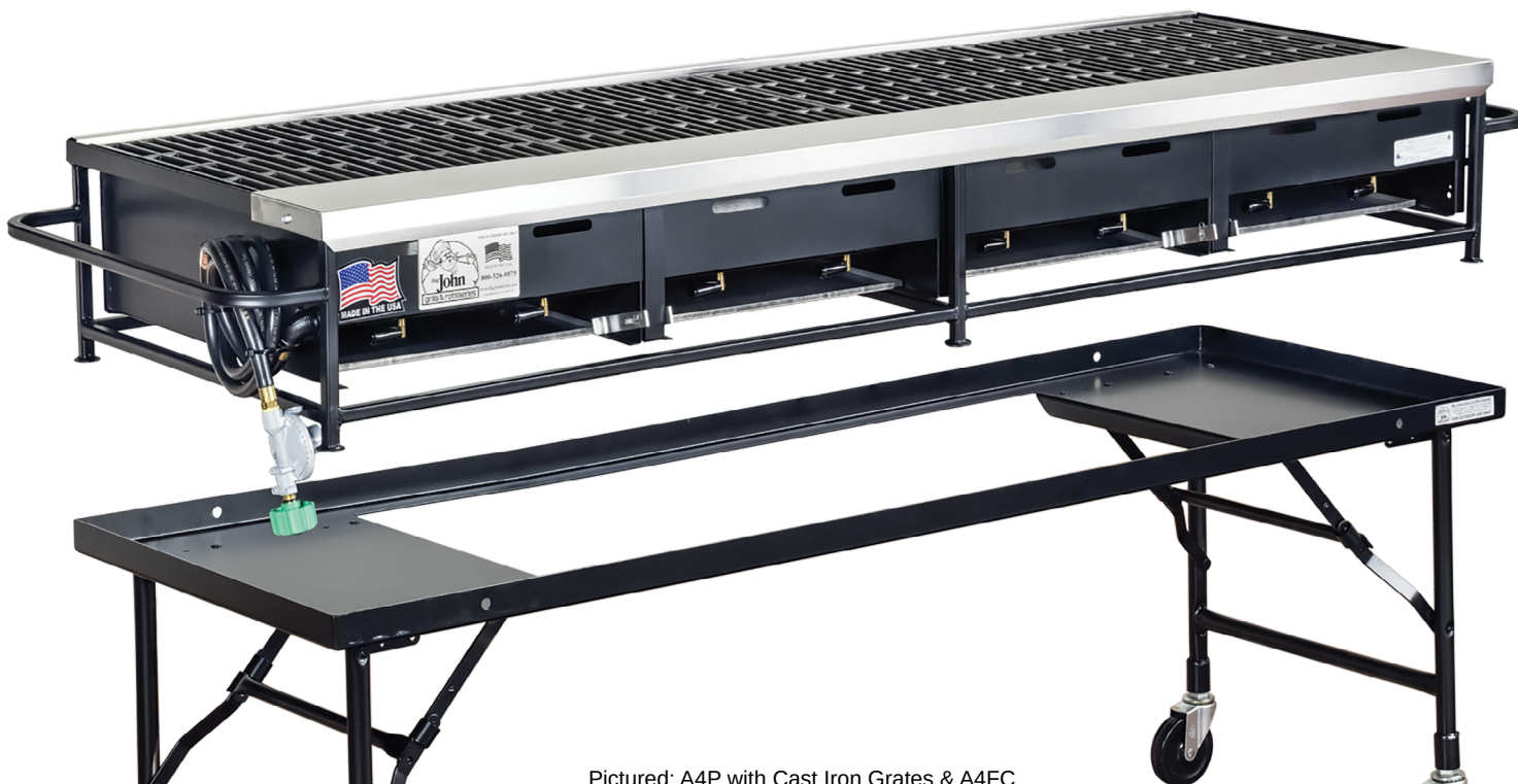
Pictured: A4P with Cast Iron Grates & A4FC