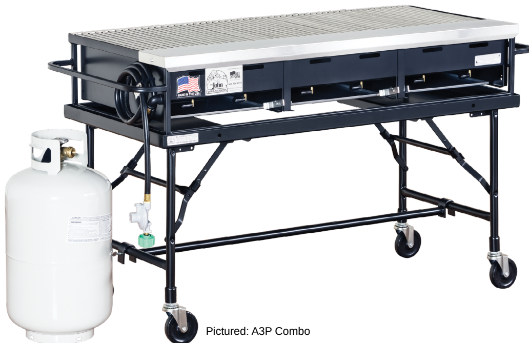
Pictured: A3P Combo

Made with a Powder-Coated Steel Frame & Stainless Steel Firebox and Components