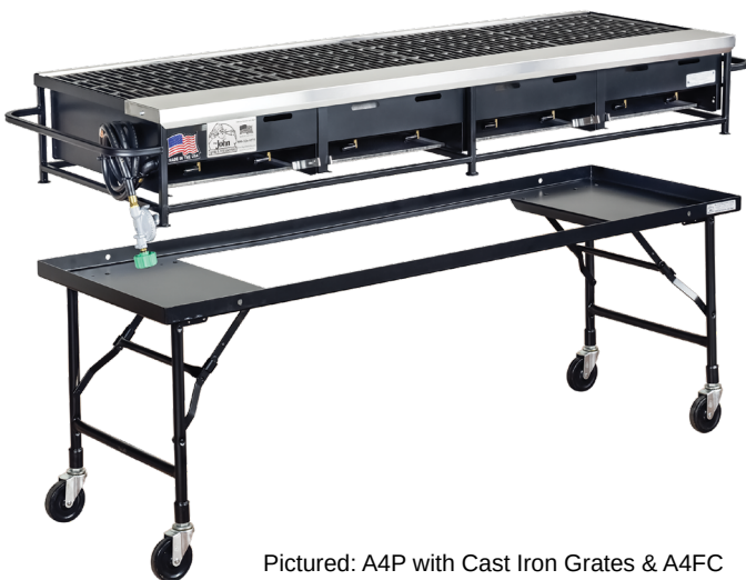
Pictured: A4P with Cast Iron Grates & A4FC